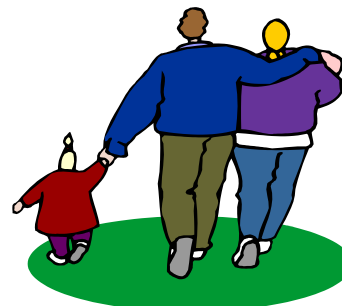
We're walking to fight hunger!