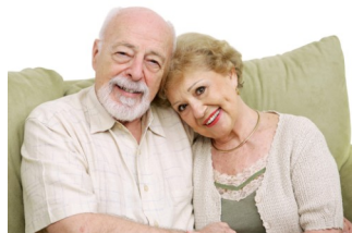
Planning ahead gives you piece of mind

an active Unitarian. We hope to extend him a warm welcome and expect to gain immensely from his knowledge and expertise.